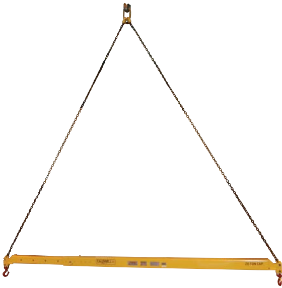
Shown with Option C